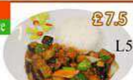
L5 £7.5 肉沫茄子饭 Aubergine & Pork Mince Rice