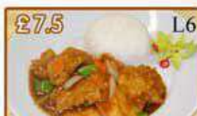
L6 £7.5 家常豆腐饭 Tofu & Vege Rice