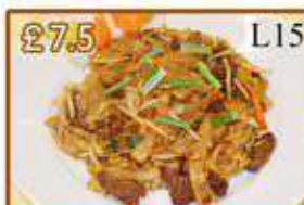
L15 £7.5 干炒牛河 Stir Fried Beef Hofun