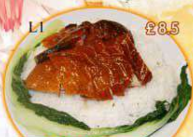
L1 £8.5 烧鸭饭 Roast Duck Rice