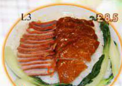
L3 £8.5 双拼饭 2 BBQ Combo