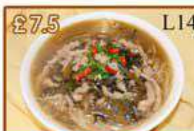
L14 £7.5 雪菜肉丝汤米 Pickled Vege Meat Shredded Mifen