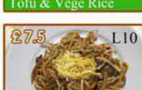
L10 £7.5 干炒乌冬 (鸡、牛) Stir Fried Udon Chicken/ Beef