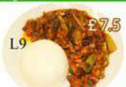
L9 £7.5 湘味炆鸡饭 Mountain Chilli Chicken Rice