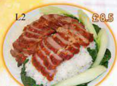
L2 £8.5 蜜汁叉烧饭 Char Siu (Roast Pork) Rice