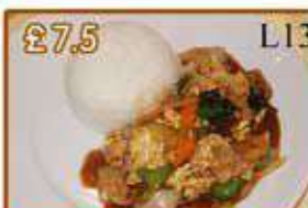
L13 £7.5 木须肉饭 Mu Xu Pork Rice