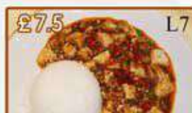
L7 £7.5 麻婆豆腐饭 MaPo Tofu Rice