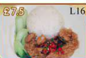
L16 £7.5 豉汁排骨饭 Ribs Black Bean Rice