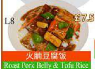
L8 £7.5 火腩豆腐饭 Roast Pork Belly & Tofu Rice