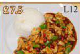
L12 £7.5 宫爆鸡丁饭 Traditional Kong Po Chicken Rice