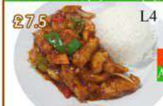
红烧 / 香辣鱼柳饭 Stir fried fish fillet (Spicy or none spicy) Rice