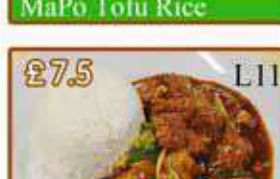
L11 £7.5 时菜牛腩饭 Beef Brisket & Vege Rice