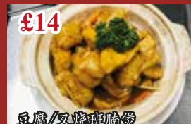
豆腐/叉烧班腩煲 Monkfish with Char Siu or Beancurd