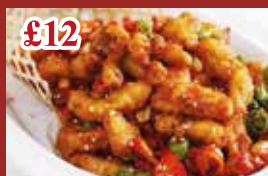
椒盐猪扒 Salted Chilli Pork Chop