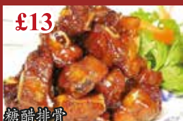
糖醋排骨 Sweet & Sour Ribs Northern China Style