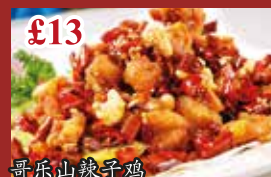
哥乐山辣子鸡 Sichuan Spicy Popcorn Chicken