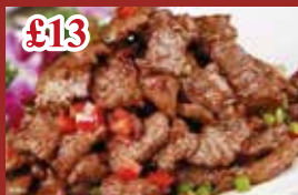
孜然牛肉 Sizzling Beef with Cumin