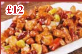
公宝鸡丁 Traditional Kung Po Chicken