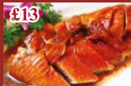
半烧鸭 Roast Duck BBQ HK Style