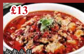
水煮牛肉 Sliced Beef in Hot Chilli Oil (Hot szechuan style)