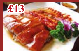
叉烧烧鸭拼 Roast BBQ Combo HK Style