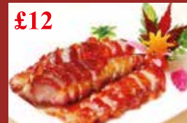
叉烧 Char Sui (BBQ Pork)