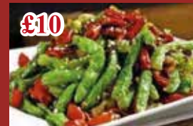
干煸四季豆 Stir Fried Fine Beans