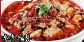
水煮牛肉 Sliced Beef in Hot Chilli Oil (Hot szechuan style)