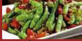
干煸四季豆 Stir Fried Fine Beans