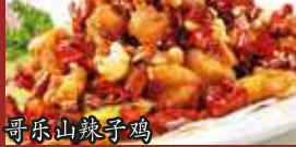
哥乐山辣子鸡 Sichuan Spicy Popcorn Chicken