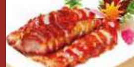
叉烧 Char Sui (BBQ Pork)