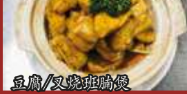
豆腐/叉烧班腩煲 Monkfish with Char Siu or Beancurd