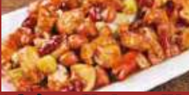
公宝鸡丁 Traditional Kung Po Chicken