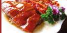
叉烧烧鸭拼 Roast BBQ Combo HK Style