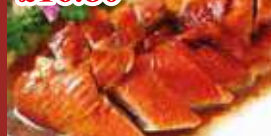
半烧鸭 Roast Duck BBQ HK Style