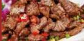
孜然牛肉 Sizzling Beef with Cumin