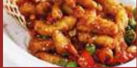
椒盐猪扒 Salted Chilli Pork Chop