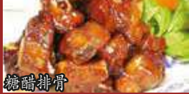
糖醋排骨 Sweet & Sour Ribs Northern China Style