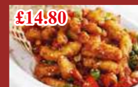
椒盐猪扒 Salted Chilli Pork Chop