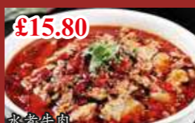
水煮牛肉 Sliced Beef in Hot Chilli Oil (Hot szechuan style)