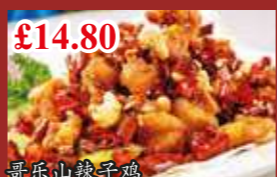
哥乐山辣子鸡 Sichuan Spicy Popcorn Chicken