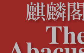
麒麟阁 The Abacus