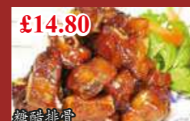
糖醋排骨 Sweet & Sour Ribs Northern China Style