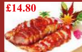
叉烧 Char Sui (BBQ Pork)

Celery, Cereals containing Gluten, Crustaceans, Eggs, Fish, Lupin, Milk, Molluscs, Mustard, Nuts, Peanuts, Sesame Seeds, Soya, Sulphur Dioxide, Food Colouring