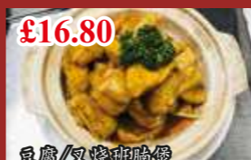
豆腐/叉烧斑腩煲 Monkfish with Char Siu or Beancurd