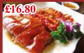
叉烧烧鸭拼 Roast BBQ Combo HK Style