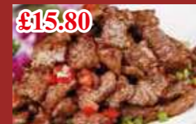
孜然牛肉 Sizzling Beef with Cumin