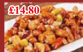
公宝鸡丁 Traditional Kung Po Chicken