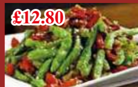
干煸四季豆 Stir Fried Fine Beans