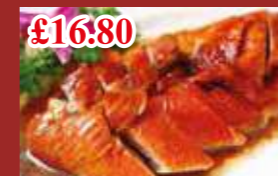
半烧鸭 Roast Duck BBQ HK Style